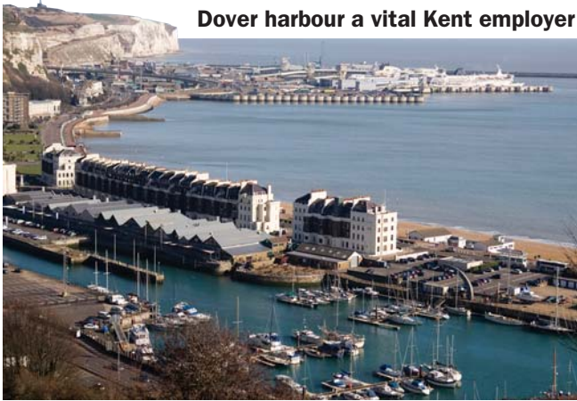
Dover harbour a vital Kent employer